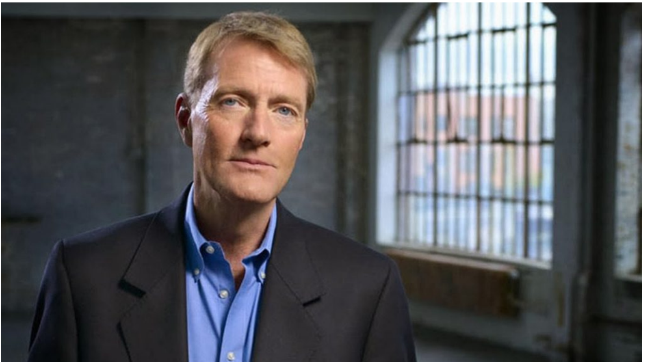
lee child network 1